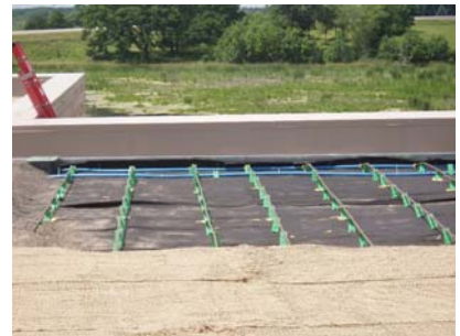
Drainage layer is being poured