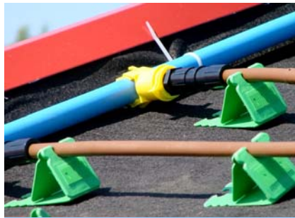
“DripGrip” support pipe